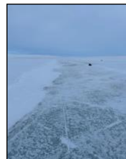
Photo of a frozen airstrip.

The Community Winter Access Trail (CWAT) reduces commodity shipping costs to Alaska Native villages in the North Slope Borough (NSB) by providing critical seasonal access for authorized vehicles and goods.